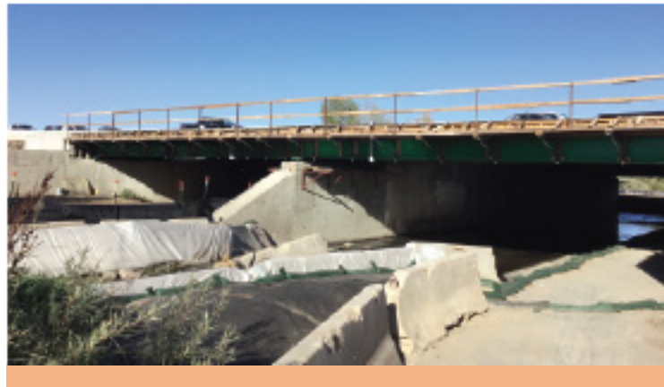
Big Dry Creek Bridge, south of 136th Avenue

Sound walls reduce noise by blocking the direct travel of sound waves from a highway to adjacent homes, forcing the waves over the top and around the wall. The new sound walls on the North I-25 Express Lanes project will be made of concrete, replacing the previous wood fences. The new walls will greatly reduce traffic noise in adjacent neighborhoods.