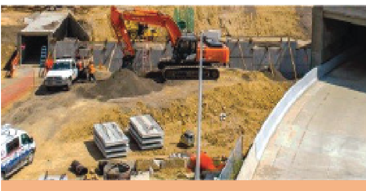
Construction Zone I-25 at 120th Avenue

Visit www.codot.gov/programs/expresslanes for information. To get an ExpressToll account and pass, visit: www.expresstoll.com.